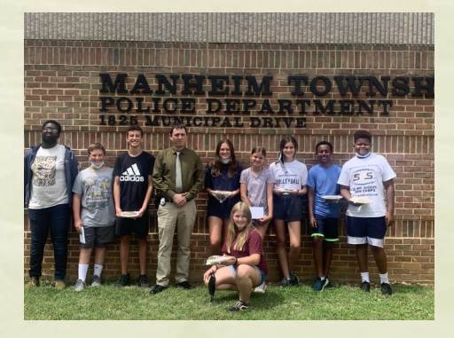
Manheim Township Police Department