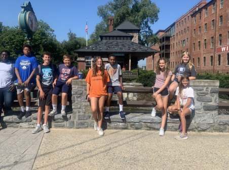
Historical Tour of Lititz, PA