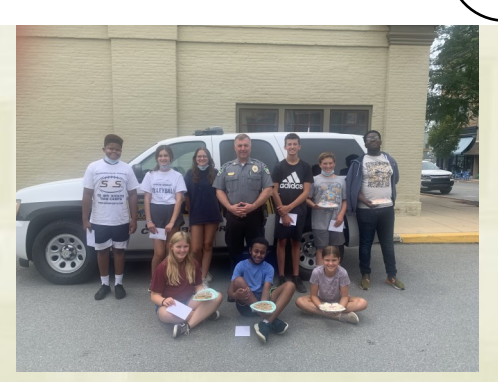
Columbia Borough Police Department

This August we had the opportunity to welcome returning and new mentors. This week of day camp is held exclusively for mentors to provide opportunities to strengthen their bonds as leaders and as a celebration of their commitment to the program. Their week included: Taking an historical walk through Lititz, PA; visiting two colleges (Thaddeus Stevens and Millersville University); taking on the highropes obstacle course at Refreshing Mountain Retreat; and performing a service project. This was an outreach project where our students decided to serve the ones who protect and serve their communities by making and delivering home-made cookies and thank you cards to Manheim Township and Columbia Borough police departments.