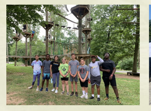
Refreshing Mountain Retreat