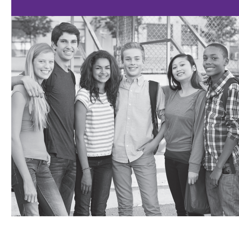
Building resilience to prevent addiction.